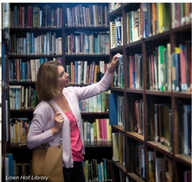
Linen Hall Library