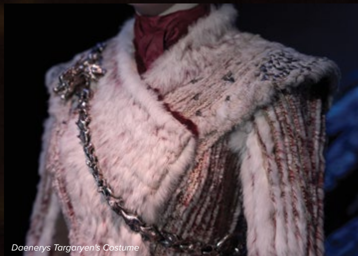
Daenerys Targaryen's Costume