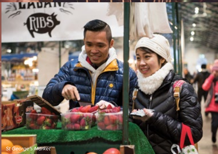
St George's Market

Food reviewers have plated up praise for Belfast's food scene and there's nothing like exploring a city, its restaurants and new culinary experiences to make mouth-watering memories. Belfast offers everything from Michelin star dining to the classic 'Ulster Fry' and the best fish and chips around, so you won't leave disappointed!