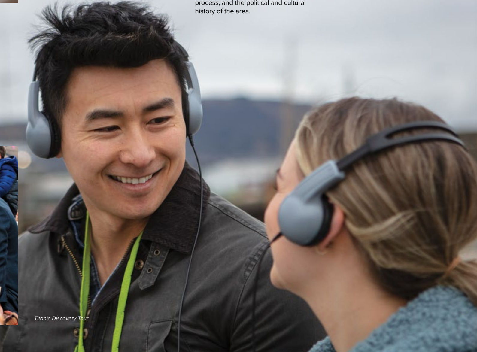
Titanic Discovery Tour

Take a bike tour around Belfast and discover a range of attractions and interesting points along the way, or create your own itinerary and hire a Belfast Bike from one of 40 docking stations located across the city centre.