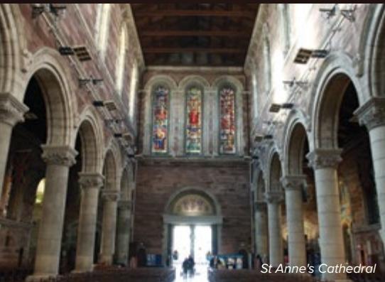
St Anne's Cathedral

Discover thousands of years of history, from the formation of the Giant's Causeway (which links County Antrim with the Western Isles of Scotland) right up to the present day.