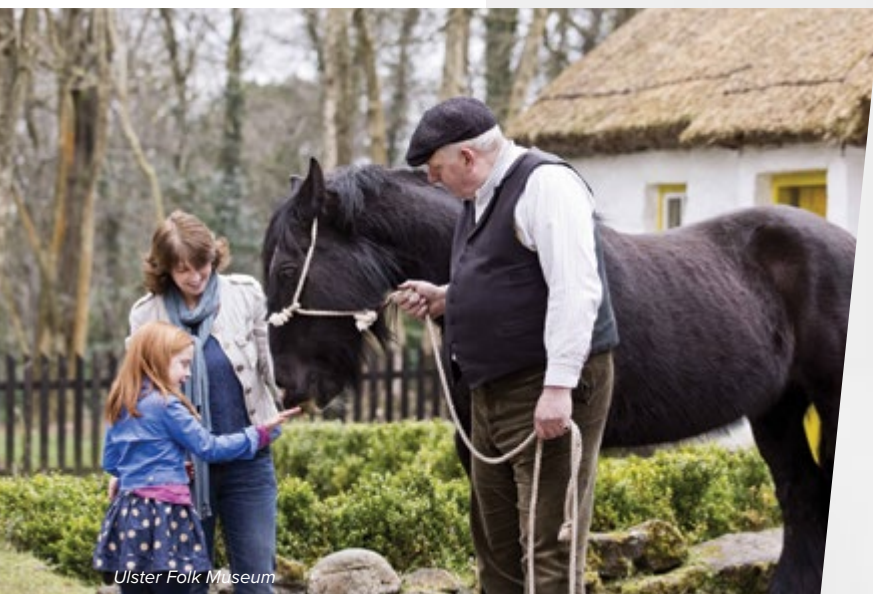
Ulster Folk Museum