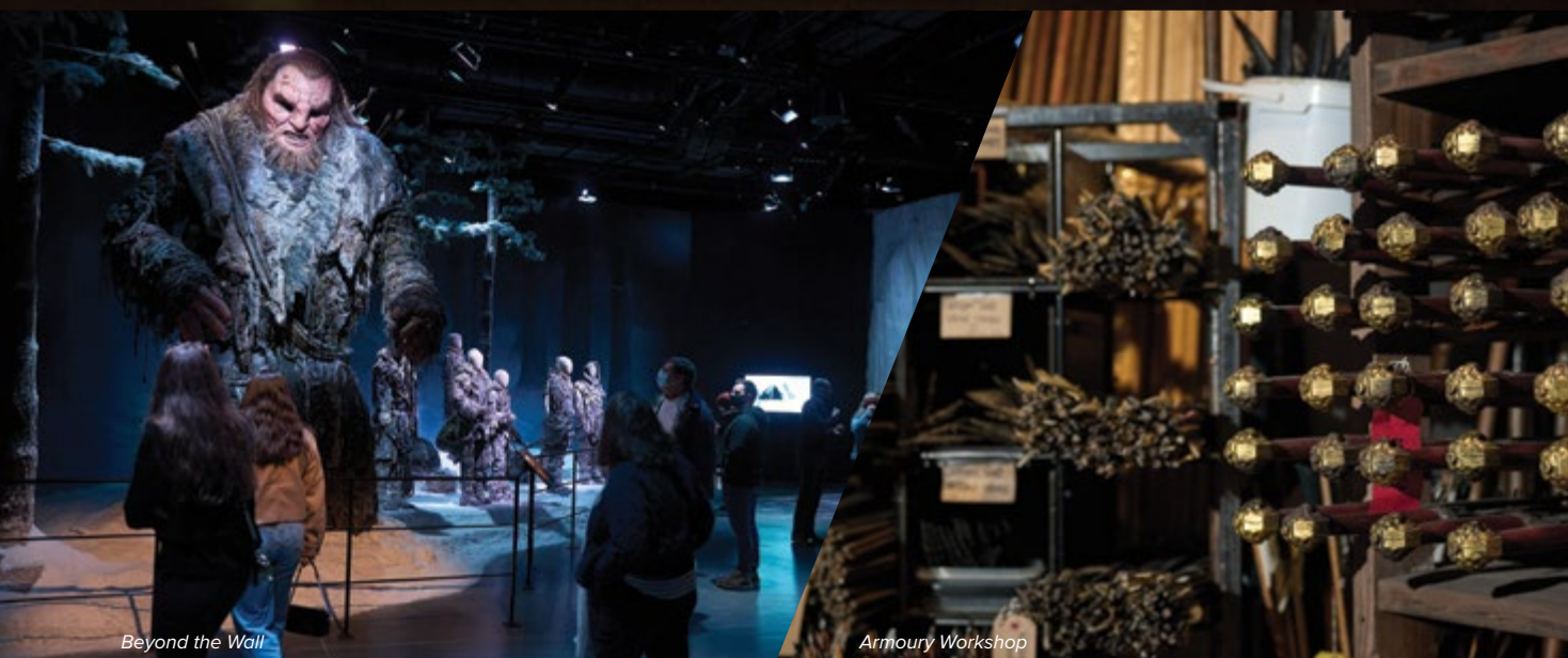
Beyond the Wall