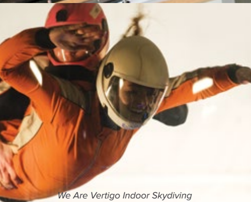
We Are Vertigo Indoor Skydiving