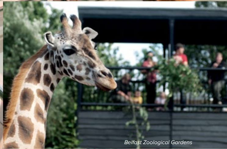
Belfast Zoological Gardens