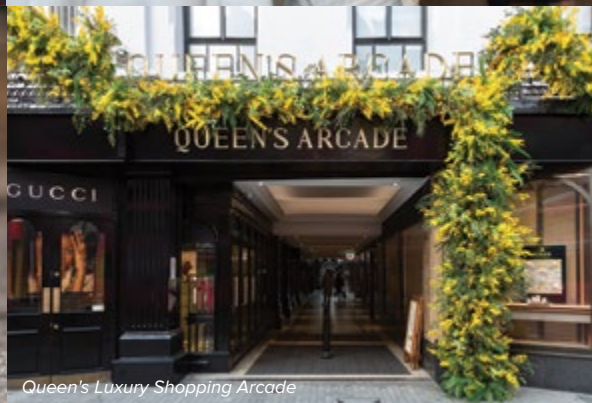
Queen's Luxury Shopping Arcade