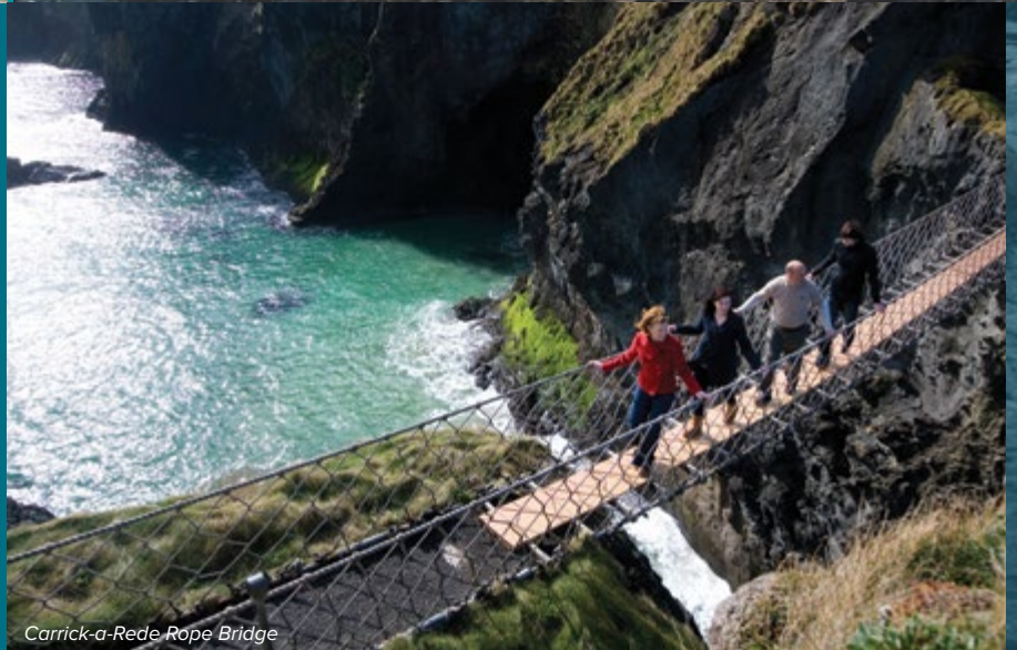
Carrick-a-Rede Rope Bridge

As a protected heritage site, spaces are limited and fill up quickly during the busy summer period, so we ask that visitors book Giant's Causeway in advance.