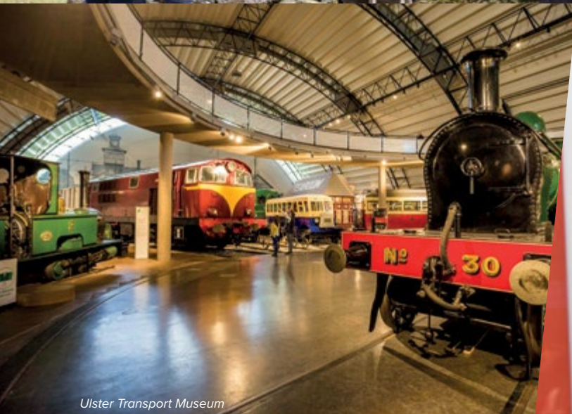
Ulster Transport Museum

Set in over 170 acres of rolling landscape overlooking Belfast Lough, visitors can stroll through the past and discover how people lived over the centuries. Leave the hustle and bustle behind and be transported to a bygone era in a place of century-old thatched cottages, farms, schools and shops as you wander the cobbled streets of Ballycultra town or the picturesque country walks around the rural tranquillity of the Ulster Folk Museum. There's a working farm as well with a variety of animals that would have been found in the Ulster countryside of the 1900's.