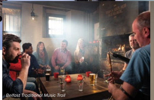
Belfast Traditional Music Trail