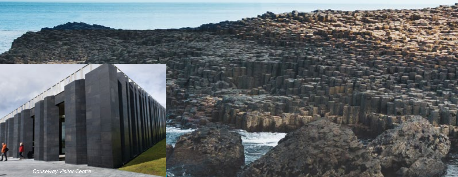
Causeway Visitor Centre

A UNESCO World Heritage site, the Giant's Causeway is a magnificent, mysterious geological formation on the Causeway Coastal Route.